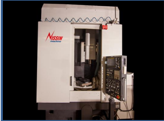
LA Gauge Company American Precision, At Its Best